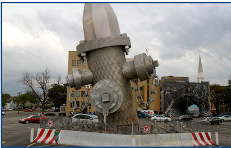
BUSTED PLUG (COLUMBIA, SC)

The most popular attraction is the Nickelodeon theatre, a 2 screen storefront theater located on Main Street, but you can also witness the Busted Plug or the South Carolina State Museum among many others.