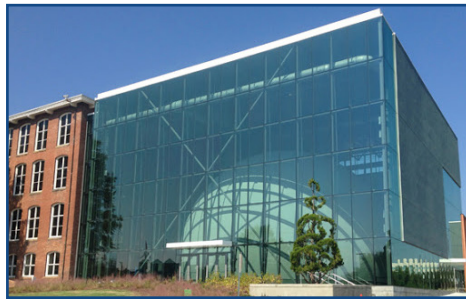
SOUTH CAROLINA STATE MUSEUM