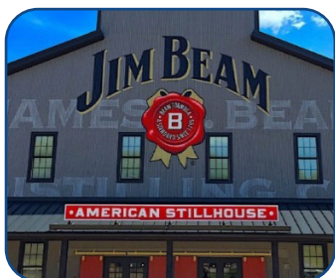
KENTUCKY BOURBON TRAIL

Kentucky has a unified statewide public defender system that is an agency of state government. Each trial office has staffing that includes attorneys, investigators, alternative sentencing workers, and administrative staff. An LSPP Fellow who works for DPA will be a full-time state employee with complete benefits (health insurance, leave time, comp time, retirement plan, HR resources) and will receive the standard starting salary for DPA attorneys (which is likely to be higher than the law school's contribution through the LSPP). Though applicants through the LSPP are applying to the statewide system, DPA and a fellowship candidate will work together to decide which specific trial office would meet the needs and goals of the candidate and the agency.