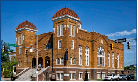
16TH STREET BAPTIST CHURCH