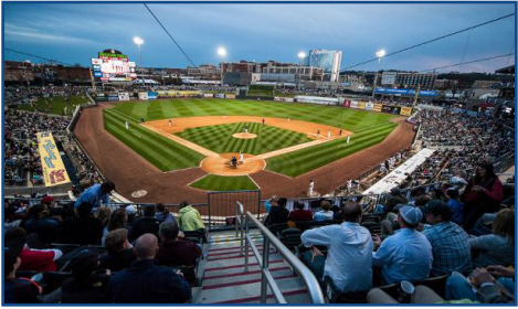
BIRMINGHAM BARONS GAME