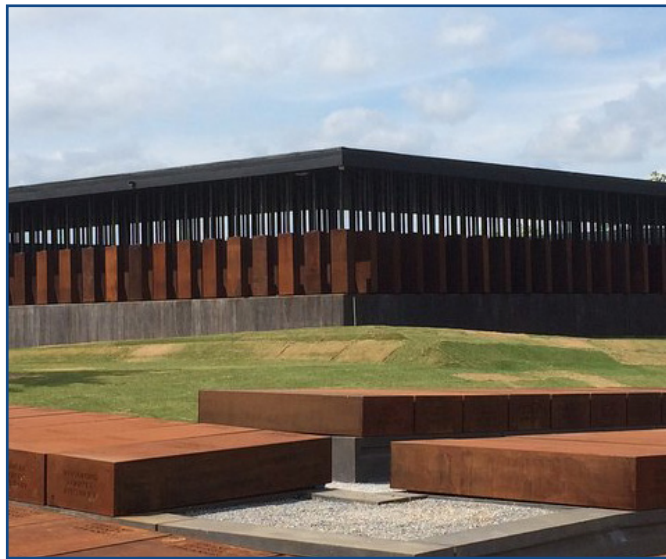
THE LEGACY MUSEUM