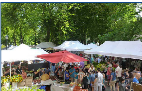
Portland University Farmer's

Japanese Garden; Rose Garden; many beautiful parks and farmers markets; lively music scene; professional soccer teams and NBA team; two major rivers; 1 1/2 hours to the Oregon Coast; skiing, hiking, and more on Mount Hood.