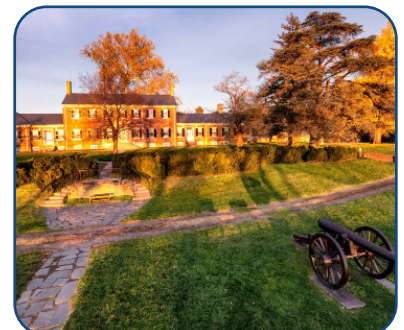
FREDERICKSBURG & SPOTSYLVANIA NATIONAL MILITARY PARK

101 MARIETTA ST. NW, SUITE 250 ATLANTA, GA 30303