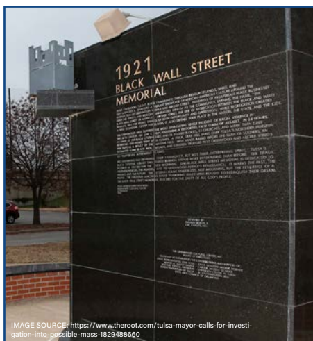
BLACK WALL STREET MEMORIAL