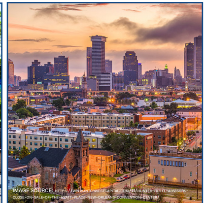
DOWNTOWN NEW ORLEANS

101 MARIETTA ST. NW, SUITE 250 ATLANTA, GA 30303