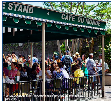
CAFE DU MONDE