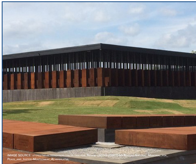
THE LEGACY MUSEUM