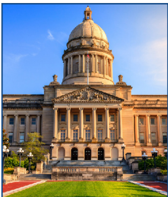
KENTUCKY STATE CAPITOL

Kentucky has a unified statewide public defender system with over 300 attorneys spread throughout 36 trial offices, capital litigation branch, an appellate branch, two post conviction branches, and an education branch. Each trial office also employs 1-2 investigators and 1-2 alternative sentencing workers who create alternative plans to incarceration for particular clients who suffer from addiction and/or mental illness issues. Applicants through the LSPP can, if they desire, express a preference to work in a particular region of the state.