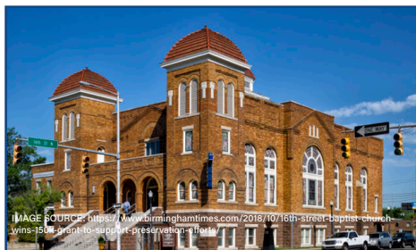
16TH STREET BAPTIST CHURCH