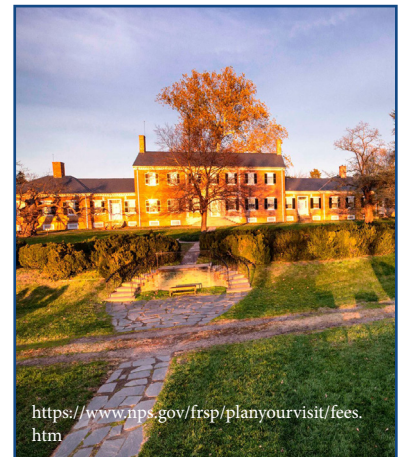
FREDERICKSBURG & SPOTSYLVANIA NATIONAL MILITARY PARK

101 MARIETTA ST. NW, SUITE 250 ATLANTA, GA 30303