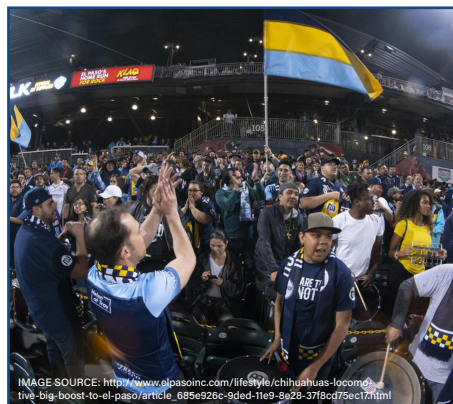
EL PASO LOCOMOTIVES