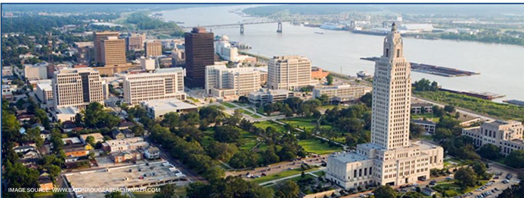
DOWNTOWN EAST BATON ROUGE