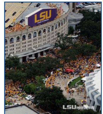
LOUISIANA STATE UNIVERSITY

101 MARIETTA ST. NW, SUITE 250 ATLANTA, GA 30303