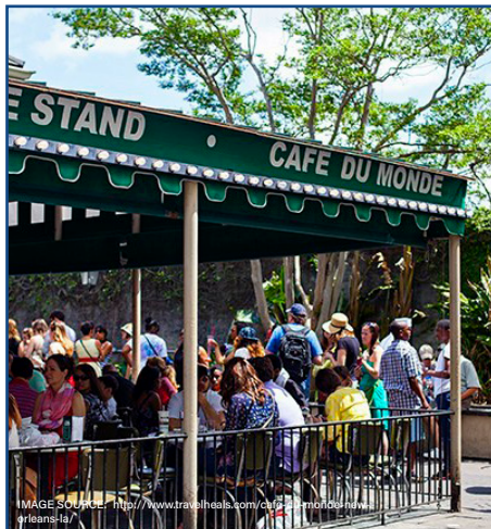
CAFE DU MONDE