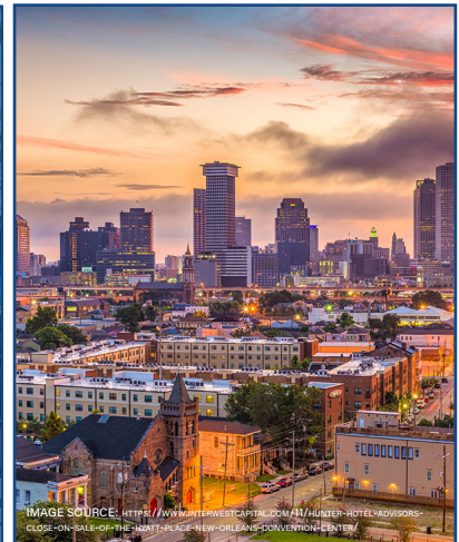
DOWNTOWN NEW ORLEANS

101 MARIETTA ST. NW, SUITE 250 ATLANTA, GA 30303