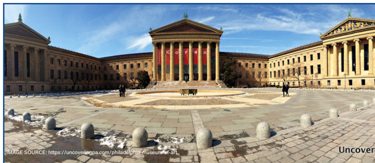
PHILADELPHIA MUSEUM OF ART