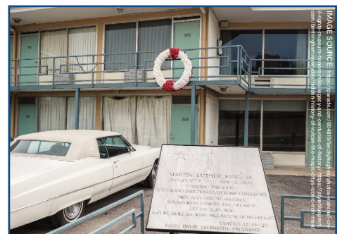
THE LORRAINE MOTEL

101 MARIETTA ST. NW, SUITE 250 ATLANTA, GA 30303