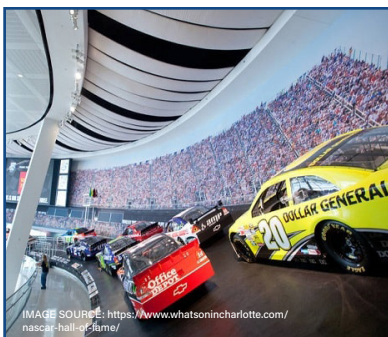
NASCAR HALL OF FAME