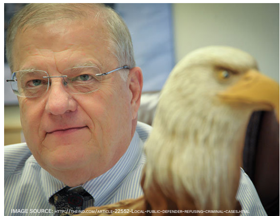
IMAGE SOURCE: http://thefrd.com/article-22552-local-public-defender-refusing-criminal-cases.html

CHIEF PUBLIC DEFENDER, 15TH JUDICIAL DISTRICT PUBLIC DEFENDER