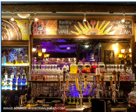
RAJIN CAJUN RESTAURANT