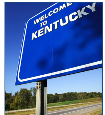
KENTUCKY WELCOME SIGN

101 MARIETTA ST. NW, SUITE 250 ATLANTA, GA 30303