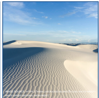
WHITE SANDS NATIONAL MONUMENT

101 MARIETTA ST. NW, SUITE 250 ATLANTA, GA 30303