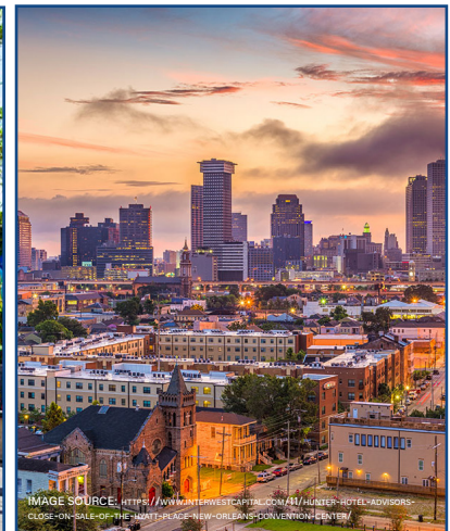
DOWNTOWN NEW ORLEANS

101 MARIETTA ST. NW, SUITE 250 ATLANTA, GA 30303