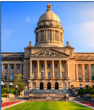
KENTUCKY STATE CAPITOL

Applicants through the LSPP can, if they desire, express a preference to work in a particular region of the state.